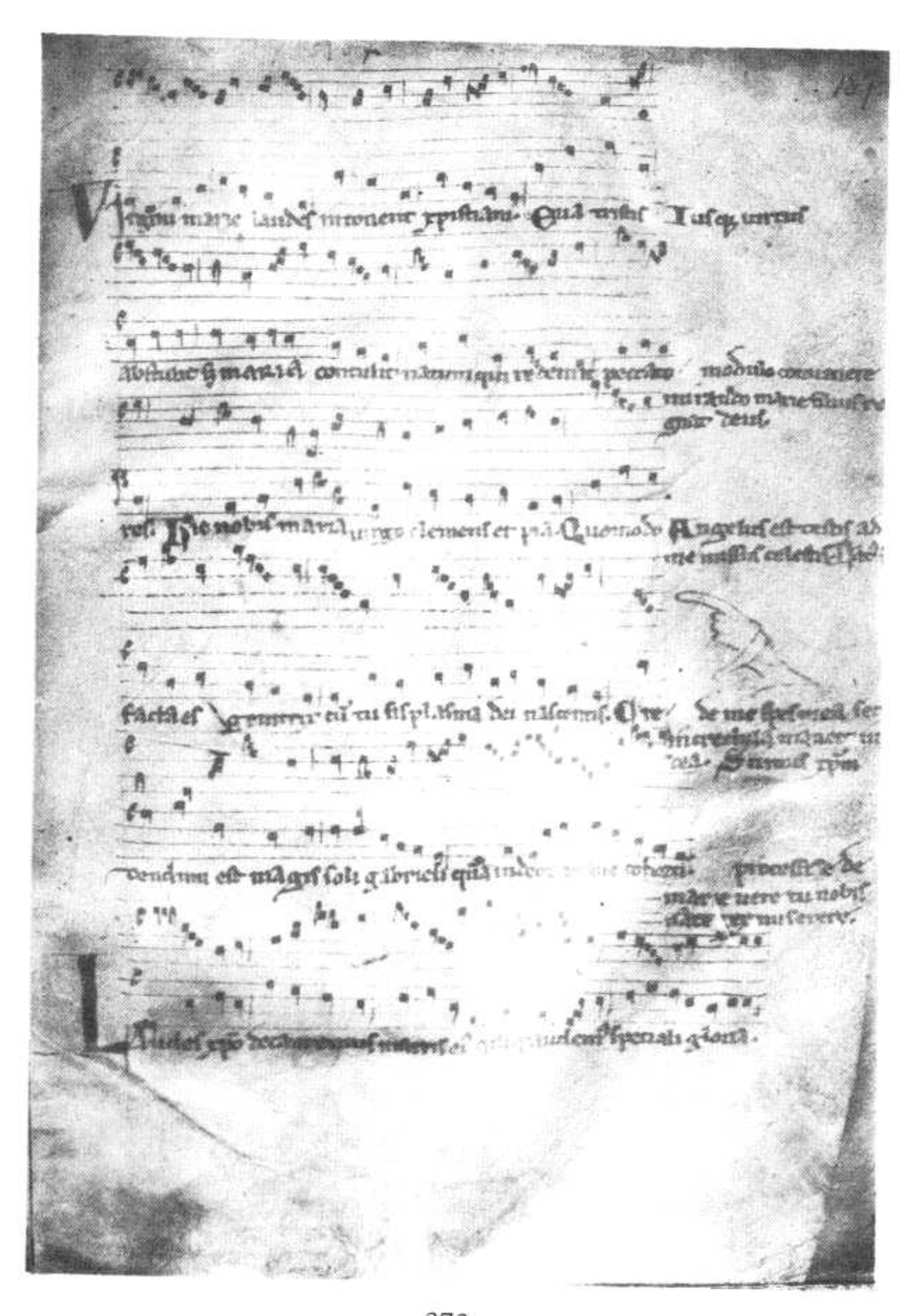
'Virgini marie' from the St Andrew's Music Book (W<sub>1</sub>)